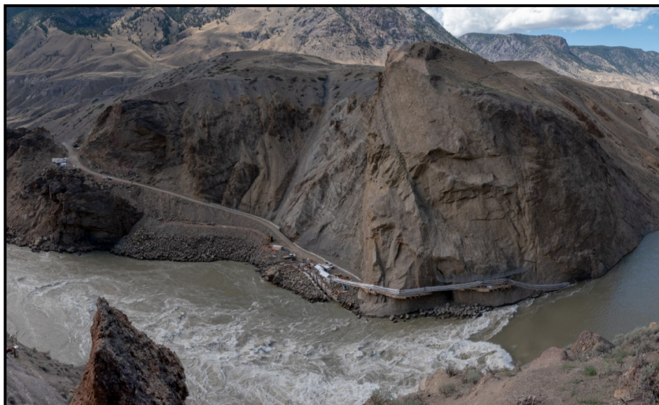
RIGHT: An overview of the Big Bar Landslide site at the end of August, 2020.

On Tuesday, the Big Bar technical working group attended a virtual briefing hosted by Keystone Engineering. Discussion focused on the successes and challenges of the summer operations and the upcoming monitoring for the fall and early winter.